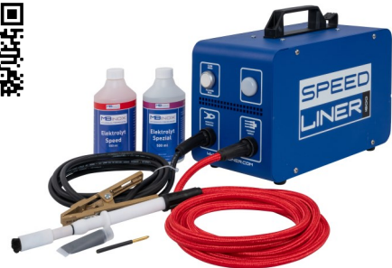
Speedliner 1600 AC / DC Basic-Set Art.-No.: 100460

Speedliner 1600 AC / DC in the basic set with the necessary equipment to get started right away. Cable extension up to 8 meters working radius possible.