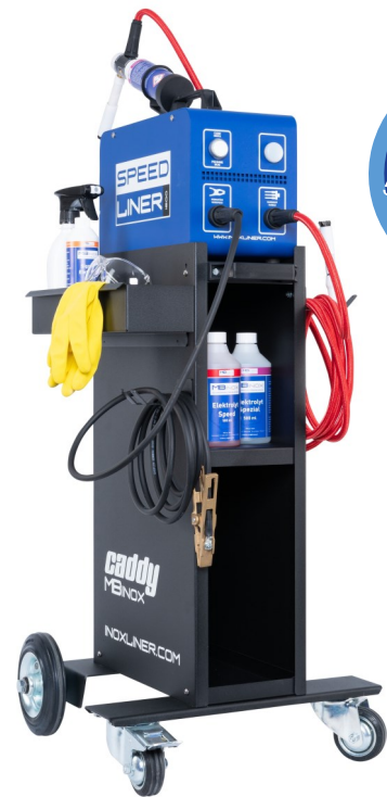
Speedliner 1600 AC / DC Power-Pack Art.-No. 100462

Speedliner 1600 AC / DC in a power pack with extensive equipment including a practical Caddy workshop trolley and Finish Easy 1-fold brush with holder. Cable extension up to 8 meters working radius possible.