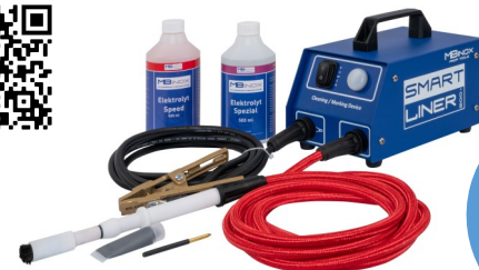
Smartliner 500+ AC Basic-Set Art.-No. 100311

Perfect for Railing construction and workshop