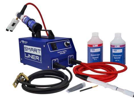
Smartliner 800+ AC Basic-Set Art.-No. 100312

Railing construction workshop Pipeline construction