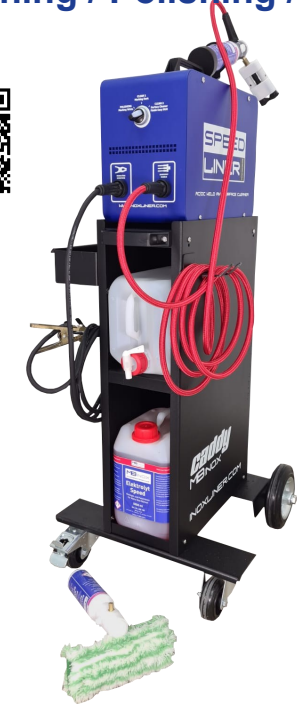
Speedliner Performance Power Pack Art.-No. 100562

Clean and polish MIG / MAG and TIG welds. Cleaning of large areas using the Finish-Easy Surface Cleaner (replaces pickling). With an extensive range, including Caddy workshop trolley, Finish-Easy 1-fold, 2-fold and surface cleaner. Cable extension possible up to a working radius of 12 meters.